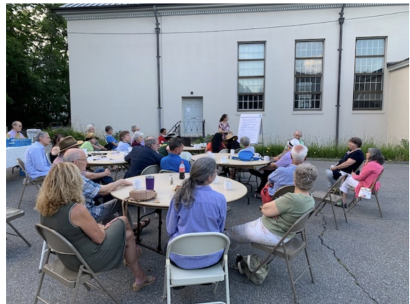
June 29th training in action. Image description: thirty people sit around tables outside, while one person reads from a flipchart.

Since these events, WCCEJ has grown even more, organizing against new gas infrastructure in Worcester and working with MassIPL to co-sponsor the upcoming Love.Earth.Justice event in October!