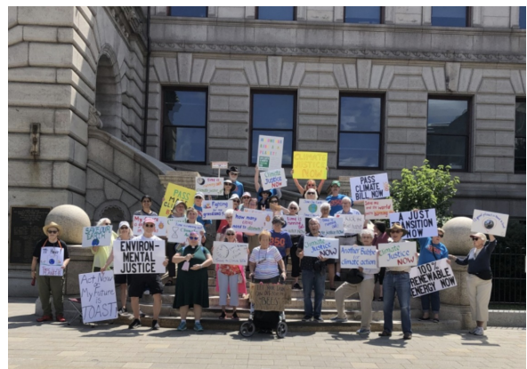
July 11th Eleventh Hour Vigil. Image description: thirty people holding handmade signs stand on the steps of Worcester City Hall.